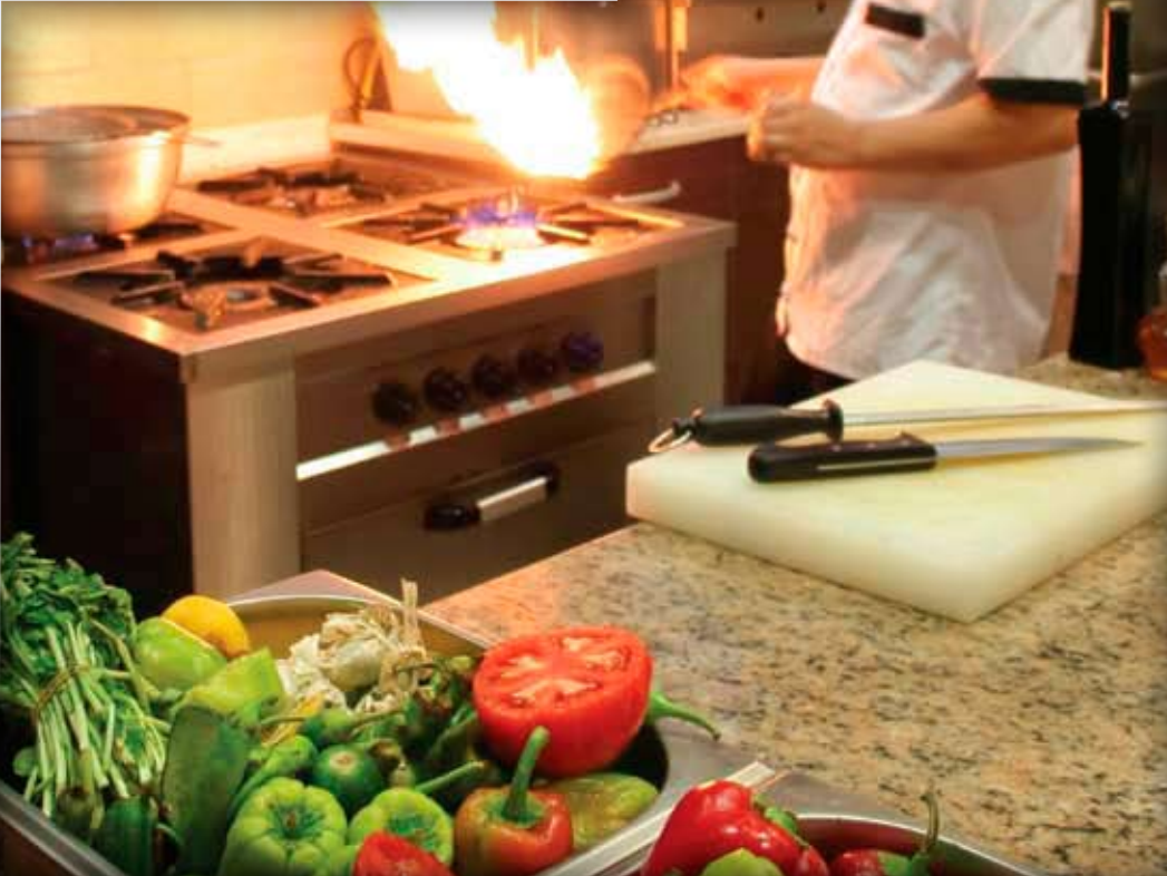
High Density Polyethylene Sheet- PE 300