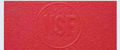
NSF Logo Finish