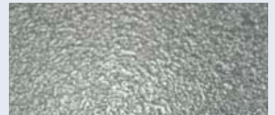
Orange Peel Finish