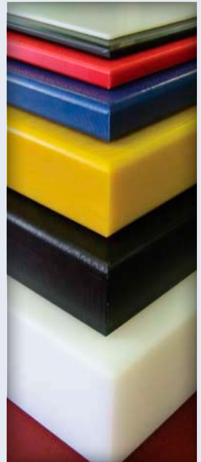
High Density Polyethylene Sheet – PE 300