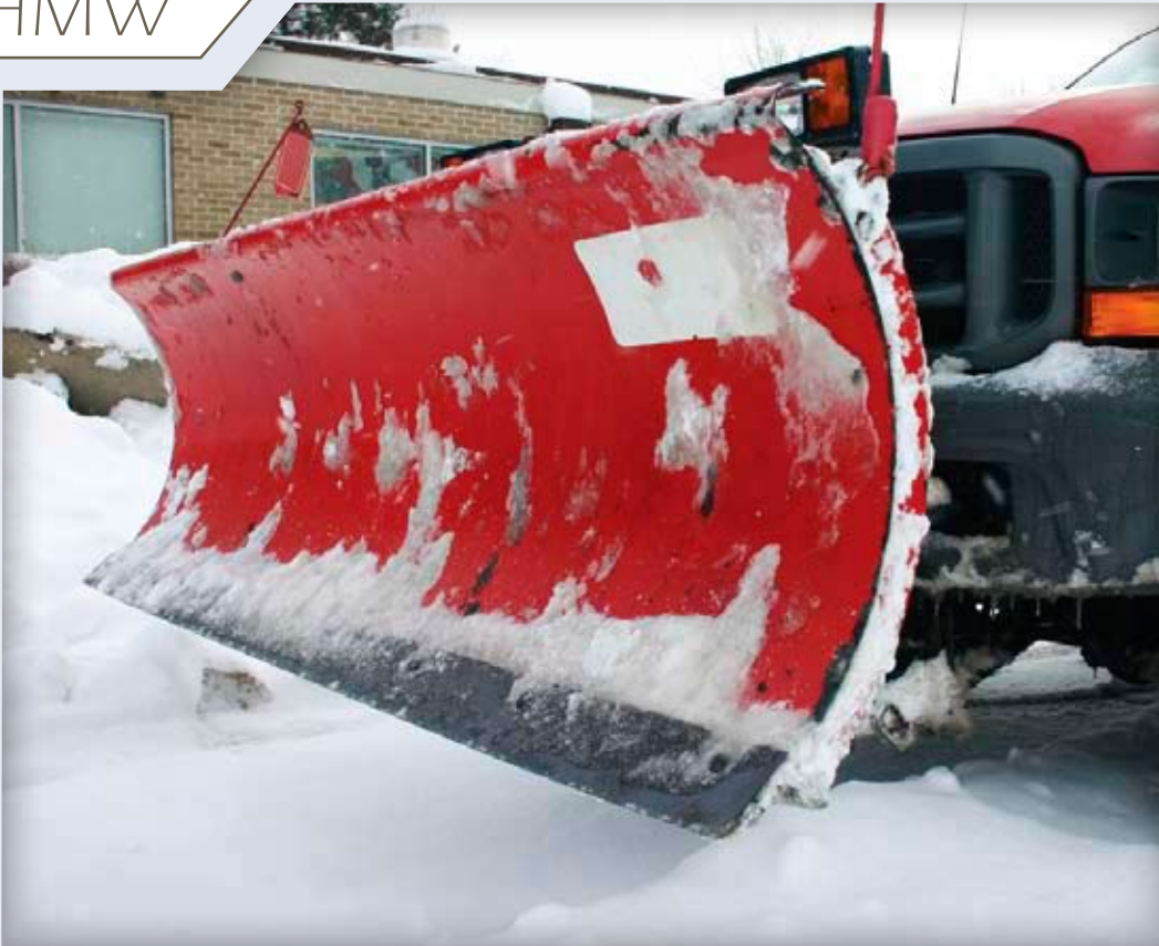
High Molecular Weight Polyethylene Sheet – PE 500