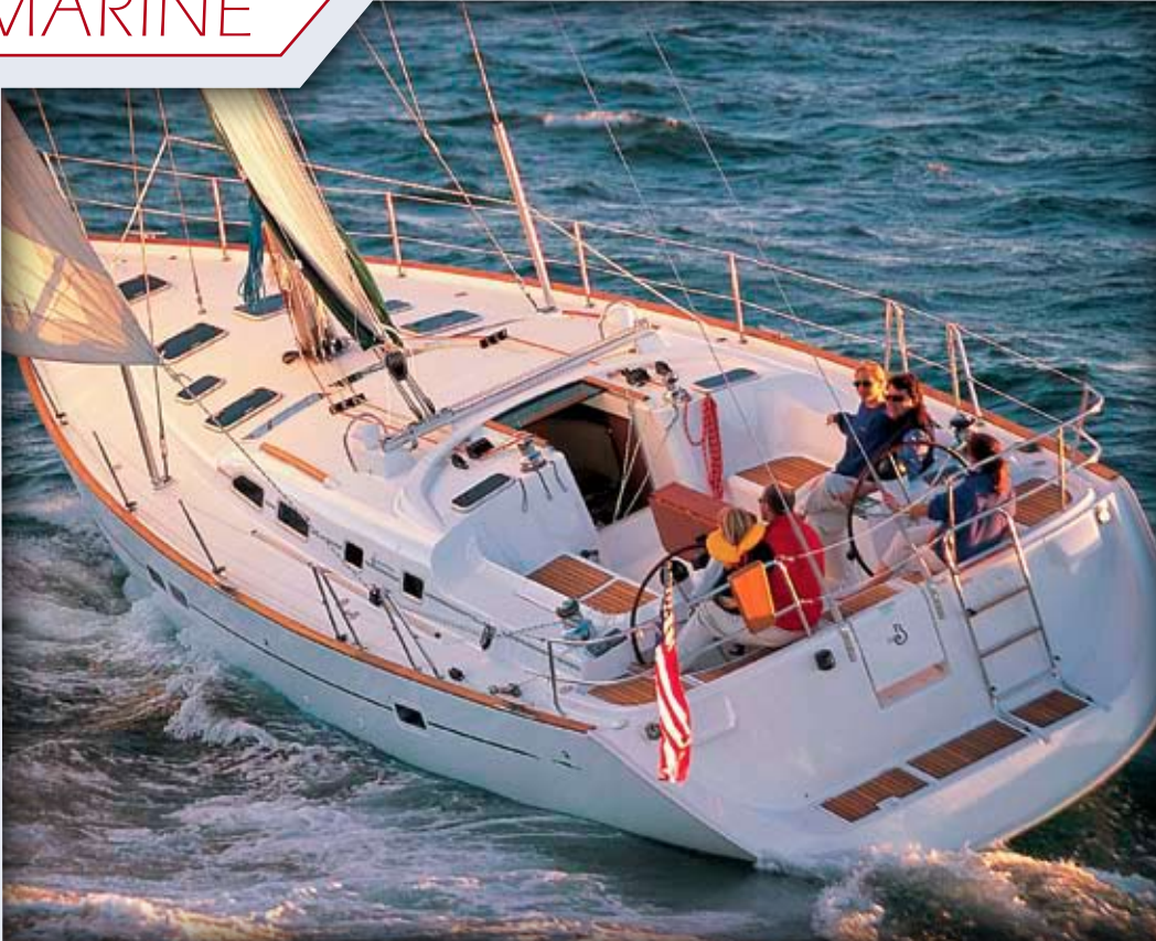
High Density Polyethylene Sheet – PE 300