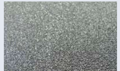
Desert Sand Finish