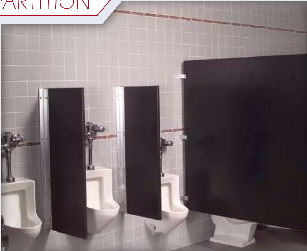
High Density Polyethylene Sheet – PE 300