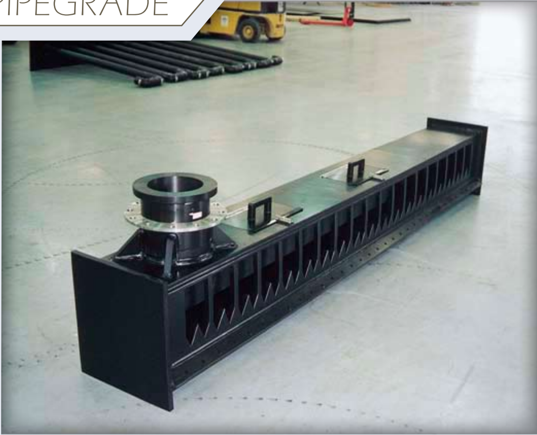
High Density Polyethylene Pipe Grade Sheet - PE80/PE100