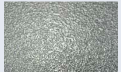
Orange Peel Finish