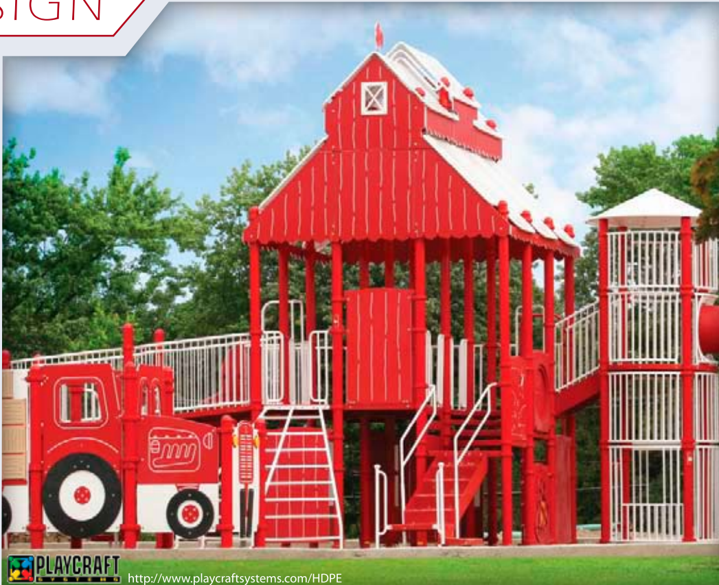
High Density Polyethylene Sheet – PE 300