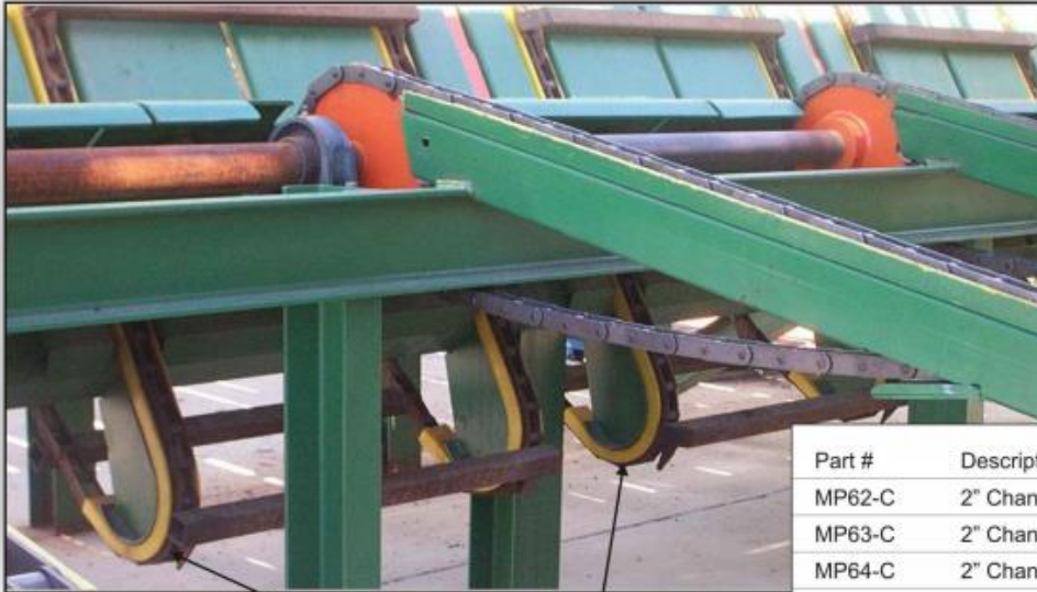
Northex Oregon Bend